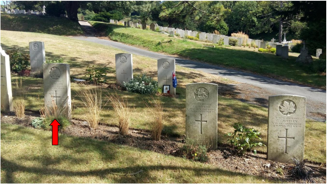
Private Helson marked with arrow