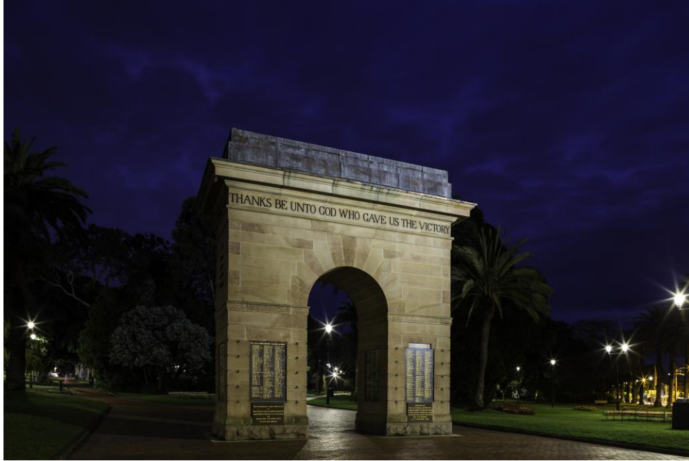
Burwood War Memorial Arch