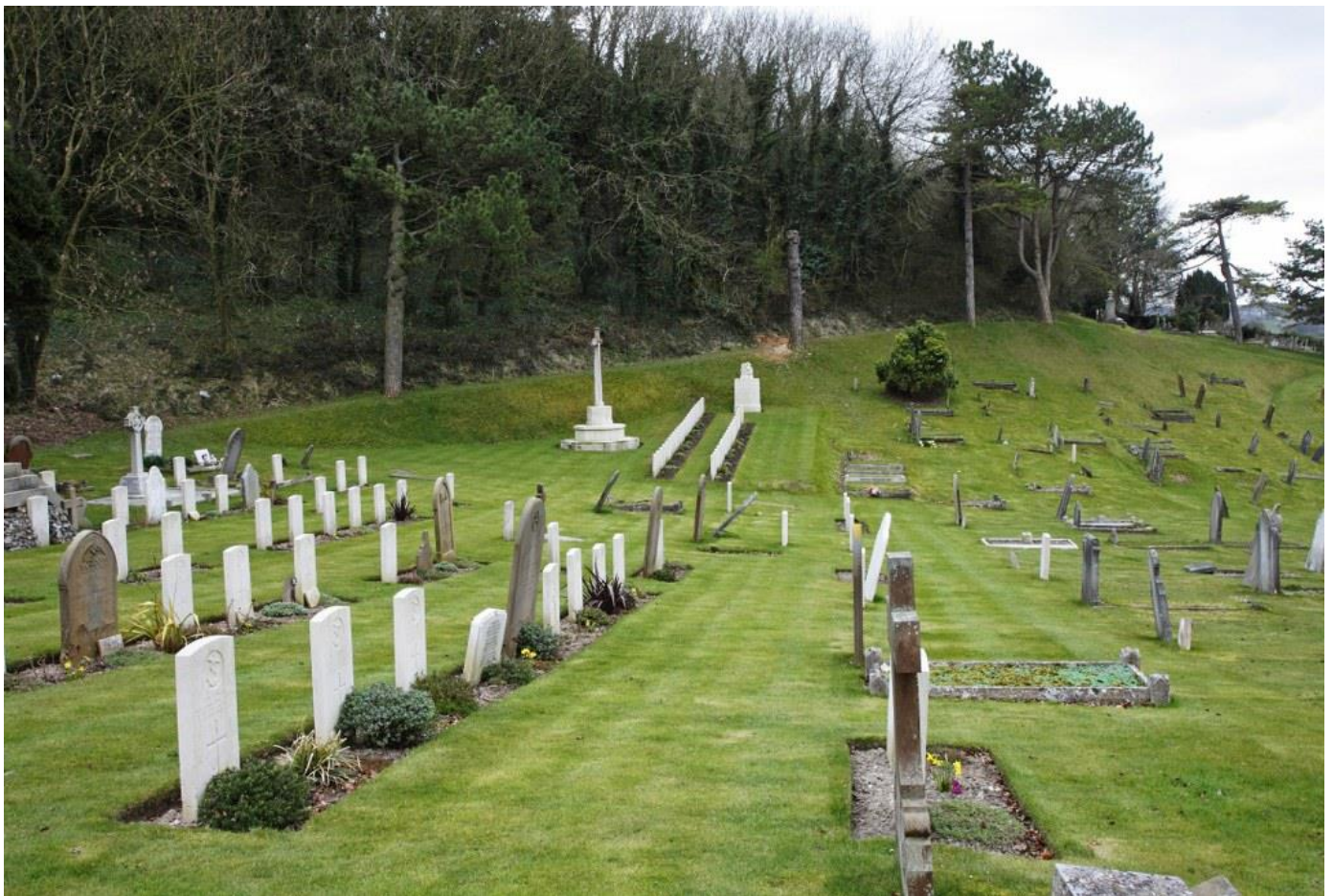
St. James Churchyard Cemetery, Dover